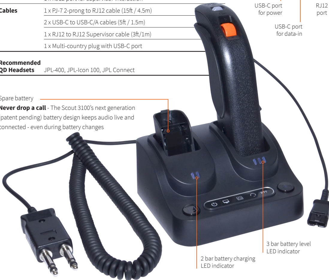
2 bar battery charging LED indicator 3 bar battery level LED indicator

Never drop a call - The Scout 3100's next generation (patent pending) battery design keeps audio live and connected - even during battery changes