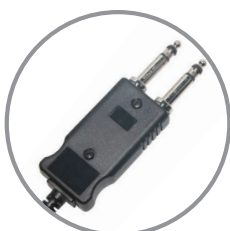
Device: PJ-7 (2 prong plug)