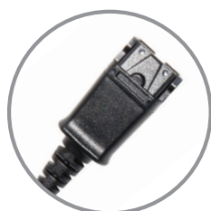
Headset: PLX compatible QD