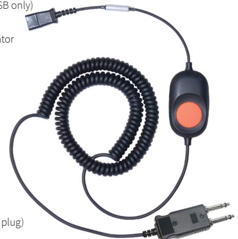
Device: PJ-7 (2 prong plug) option